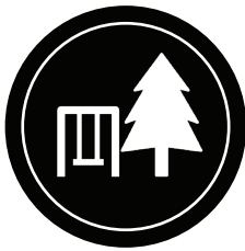
New 5+ acre park