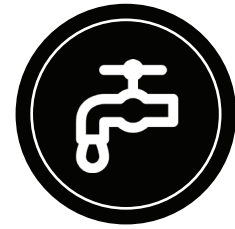
Access to all primary city services